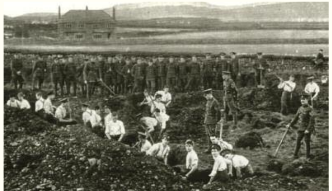
The Officers Training Corps practising entrenchment on Hango Hill in November 1914