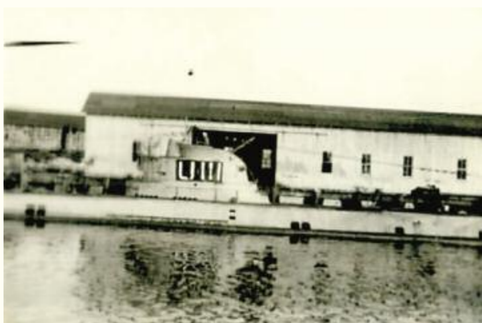
U111 entered the Irish Sea on two separate missions to sink Allied shipping.