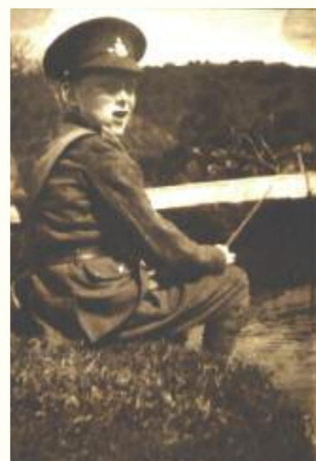
An OTC cadet on manoeuvres. C.1915