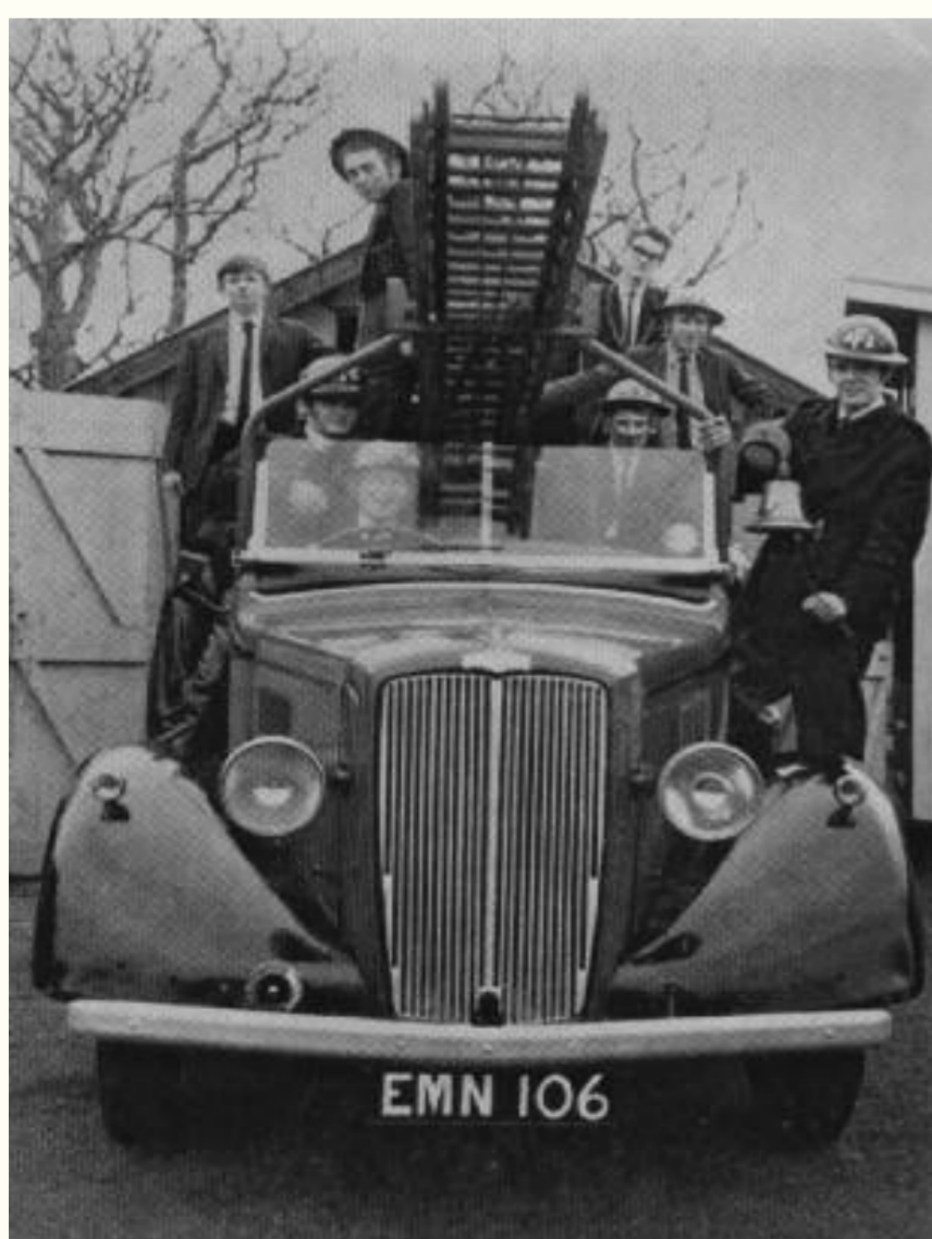
The College Fire Brigade during the 1960s