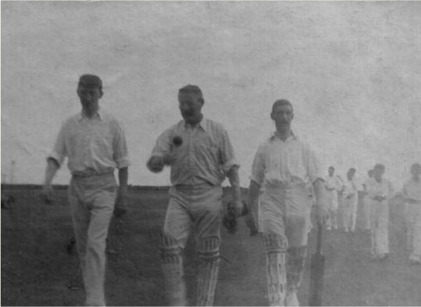
Masters v Boys c. 1900 Note the skeleton pads with exposed struts on the right hand side.