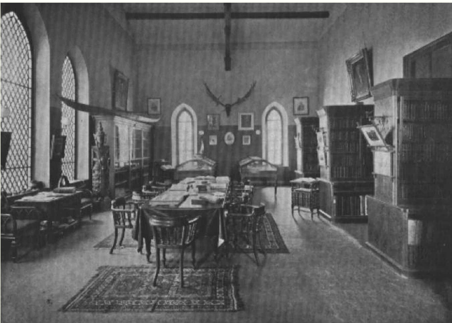
The Library and museum in 1905, which was situated at the north end of the Barrovian Hall. The Hindu statue is still on display at College.