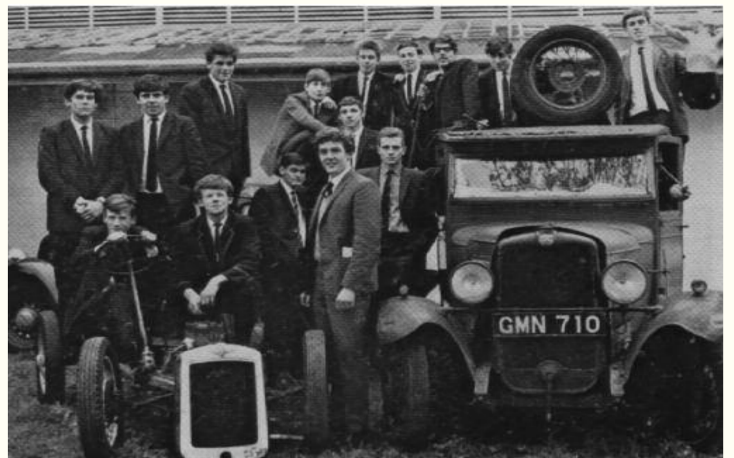
The 'Car Club', during the 1960s.