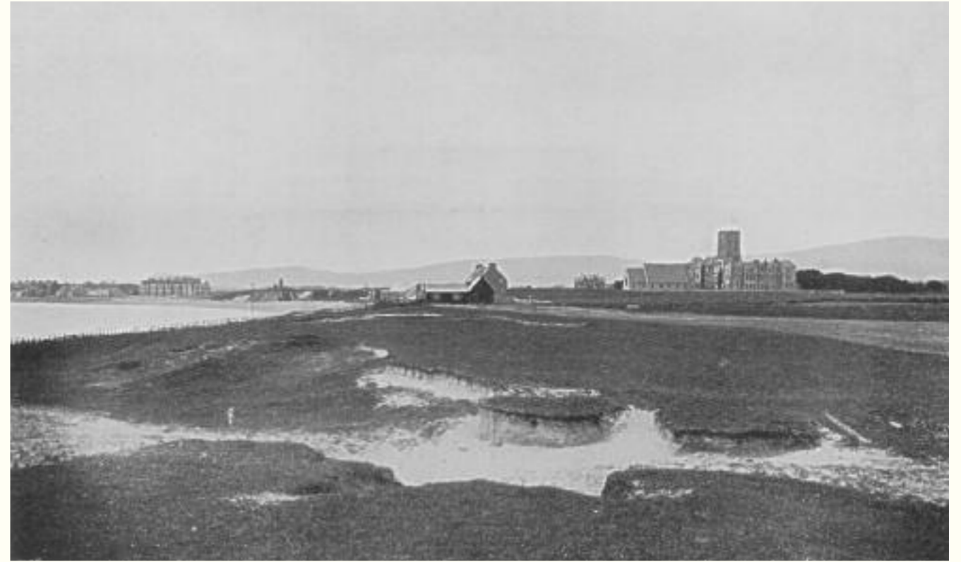
Early view of the College from the beach, showing Ballagilley farmhouse. These buildings were demolished in 1933.