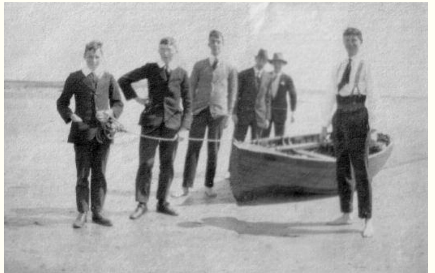
Castletown Beach c.1900. Note the Eton collars.